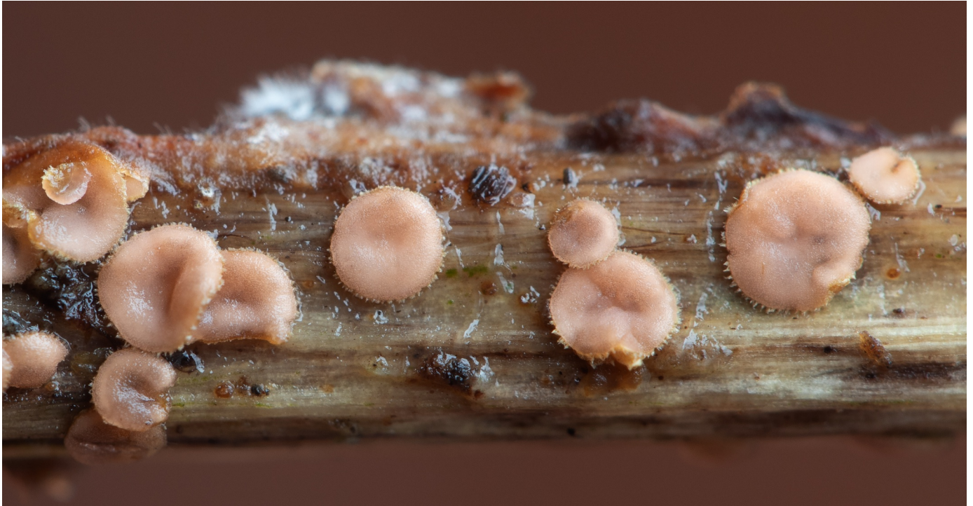
Ascomata growing on a dead herbaceous stem (most propably Urtica).