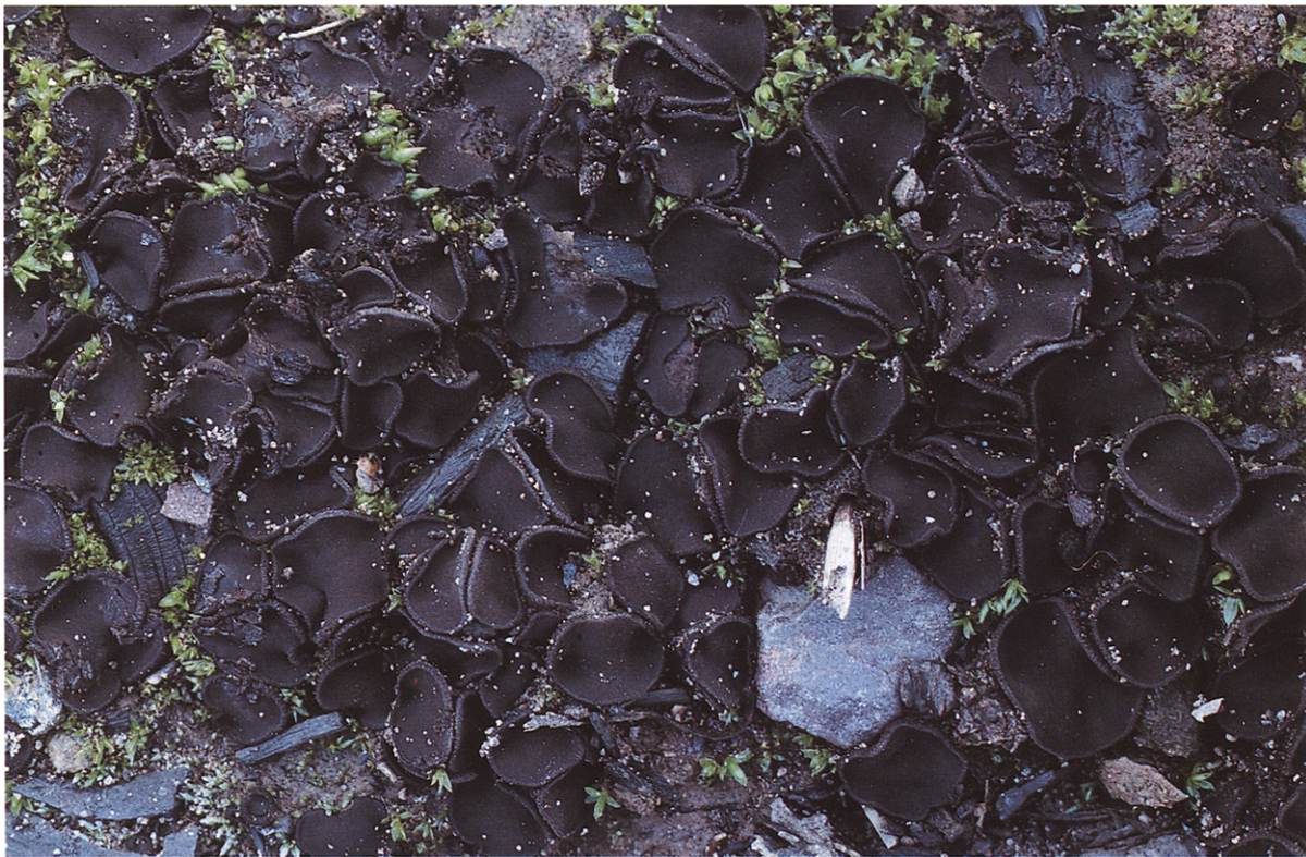
Fig 1 Apothecia of Anthracobia subatra in situ. Witley Common, November 1996.

brown granules, apically usually encrusted with dark brown matter.