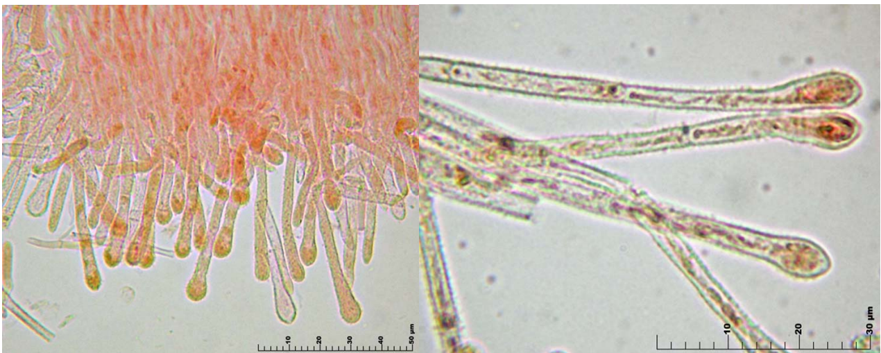
Pelos septados, finamente punteados y engrosados en la punta. Hairs septate, finely encrusted and clavate tips.

5.8 [7 ; 7.4] 8.5 x 1.2 [1.5 ; 1.6] 1.9; Q = 3.2 [4.5 ; 5] 6.3 ; N = 45 ; C = 95% ; Me = 7.16 x 1.53 ; Qe = 4.76