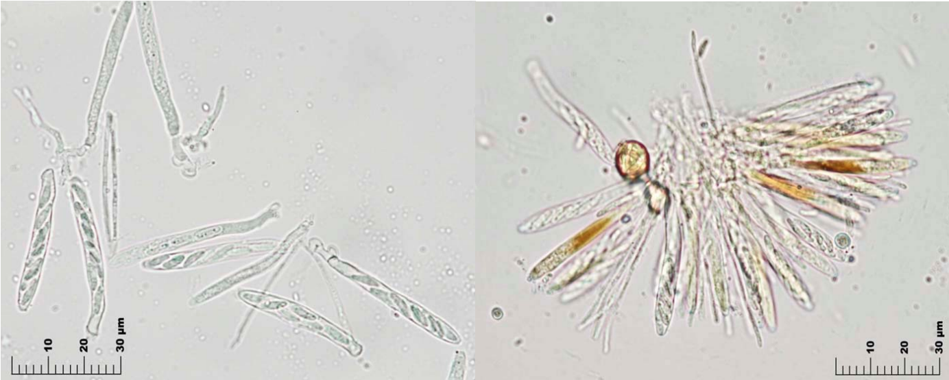
Croziers in water (left) and IKI+ asci (right) (1000x)