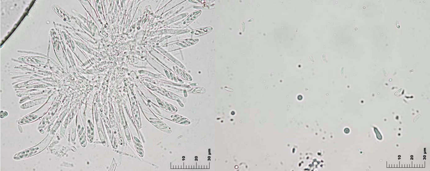
Asci and spores in water (1000x)